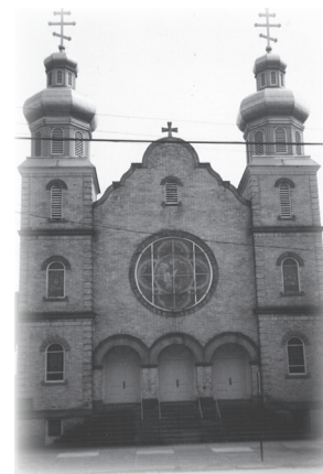
Holy Ghost Church, West 14th St., Cleveland, OH