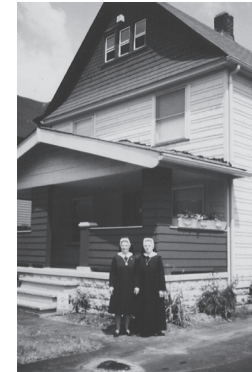
Home of the Professed Sisters, 12209 Corlett Avenue, Cleveland, OH