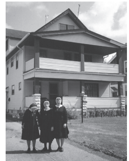
House of the Novices where the orphans and elderly were also given care.

The Blessed Sacrament was first reserved in the Chapel on Corlett Avenue on December 4th.