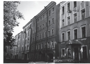
Apartment Building where the Sisters lived in St. Petersburg, Russia, taken in 2004